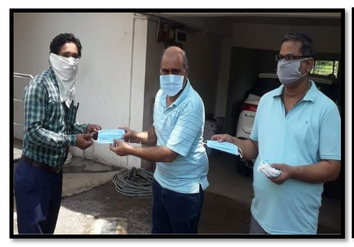
Free Mask Distribution Program