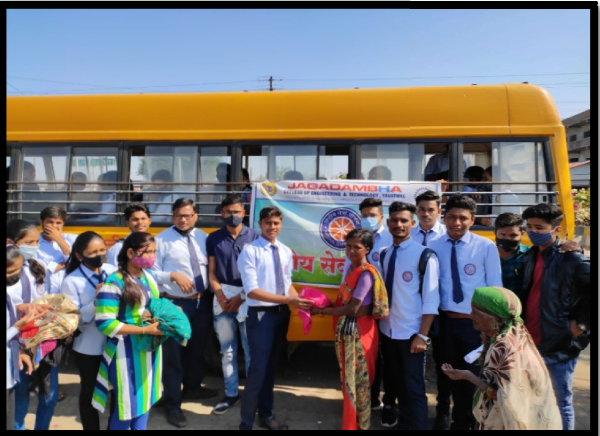
Old Cloth Distribution Program