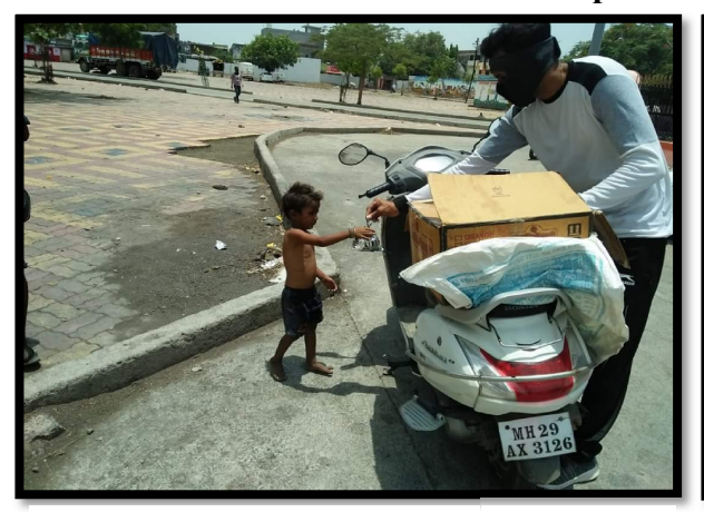
Free Food Packet Distribution Program